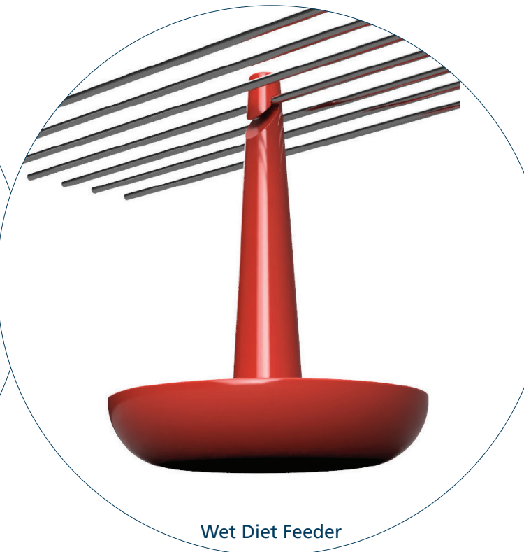
Wet Diet Feeder